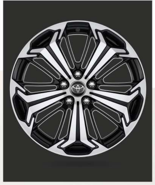
19" black machined-face alloy wheels (5-spoke) Standard on Sport