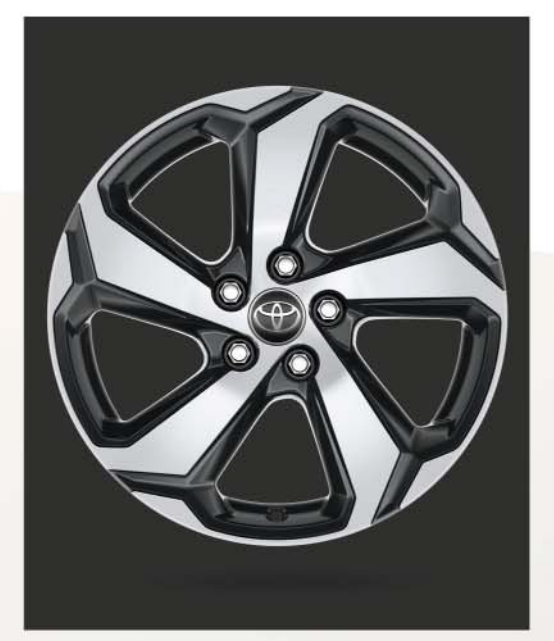
18" grey machined-face alloy wheels (5-spoke) Standard on Sol

Complete your look with a choice of head-turning 18" or 19" machined-face alloy wheels. Inside the new RAV4 Plug-in Hybrid, black leather (synthetic) with contrasting red stitching, adds an extra touch of sportiness.