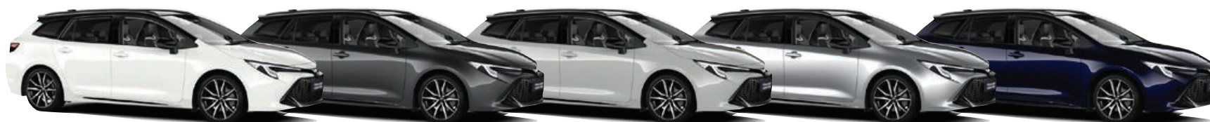
Pure White Bi-tone (2NR)