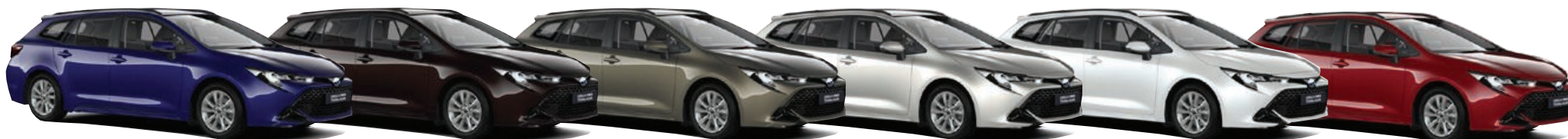
Juniper Blue (8Y8)